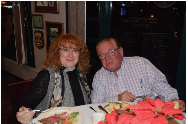
The Officers' Club at Miramar is a great place to be for the holidays!